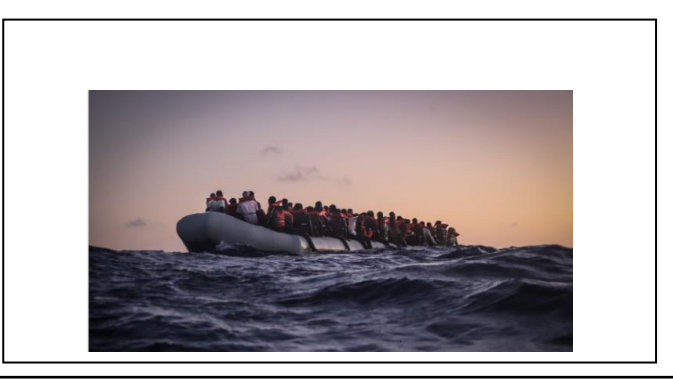
In the future/ Did you know

When Refugees come at the UK , you have to be nice to them and don't be rude