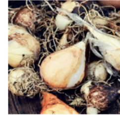
Bulbs ready for planting

Liam's daily tasks can change. What two things can make his tasks change?