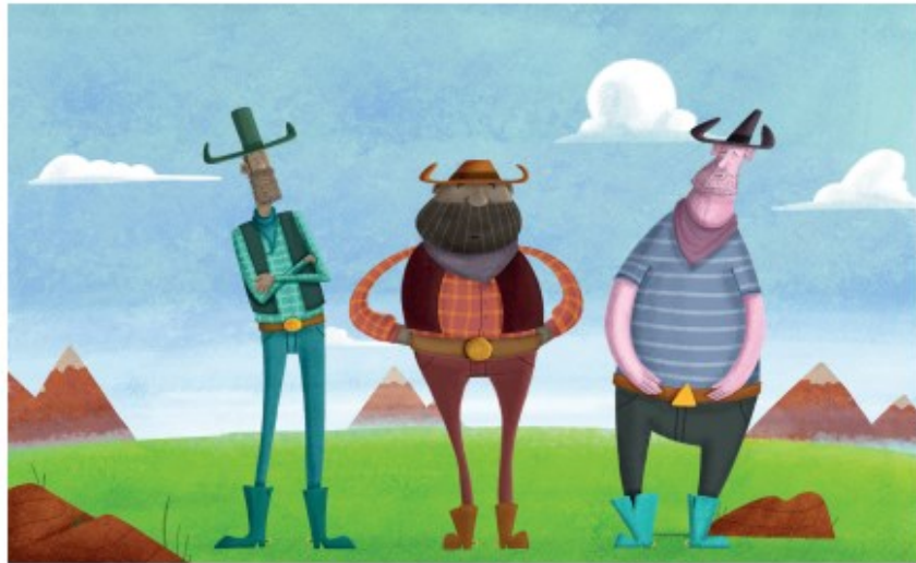
A group of cowboys

Cowboys were needed to move the cattle from one place to another. This could take months, so the cowboys lived and worked together and became friends.